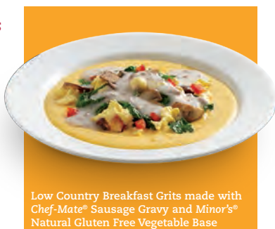
Low Country Breakfast Grits made with Chef-Mate® Sausage Gravy and Minor's® Natural Gluten Free Vegetable Base

From popular breakfast sandwiches to classic breakfast items, Nestlé Professional products allow you to add unique and flavorful twists that will get students up and moving your way every morning.